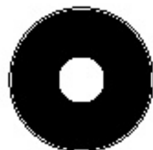
Standard including mirror band 36mm-118mm