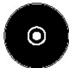
Edge to edge 20mm-32mm and 36mm-118mm